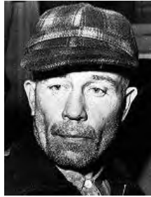
Serial killer Edward Gein.